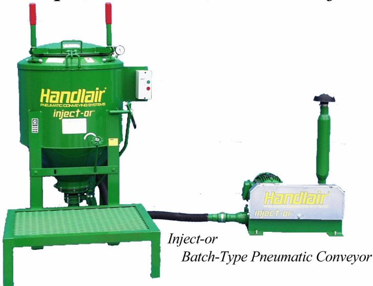
Inject-or Batch-Type Pneumatic Conveyor

Pneumatically transfer small volumes of dry flowable products: